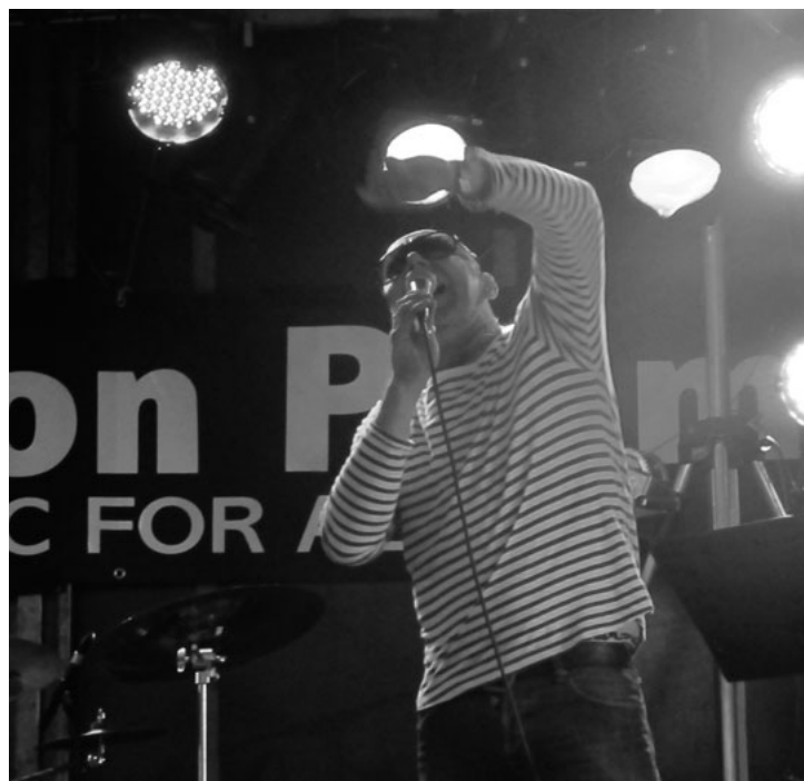
Texan Peacocks performing at last year's proms

For more information, visit www.shipstonproms.org